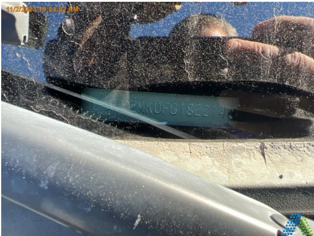
Document Name: VIN DASH.jpg