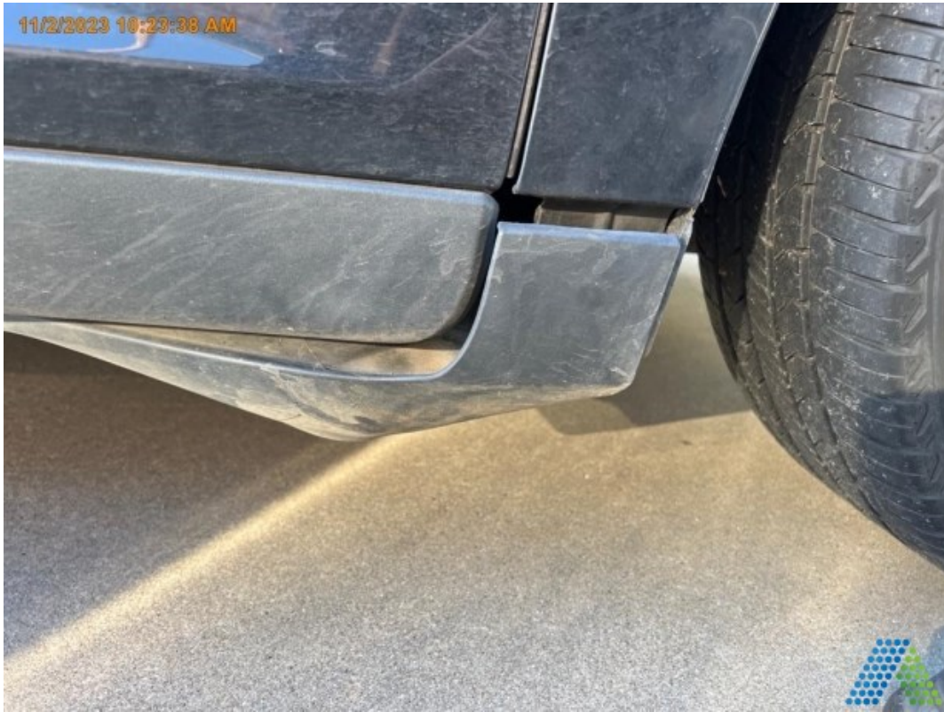
Document Name: RT ROCKER.jpg